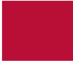
Dark Red WXR1638

SR .34 TE .86 SRI 35 SR .26 TE .86 SRI 25