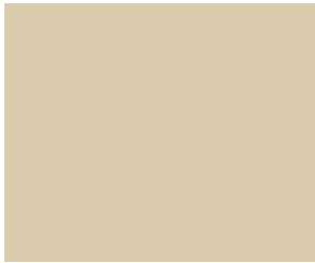
Light Stone WXD0038L

SR .36 TE .86 SRI 38 SR .29 TE .86 SRI 29